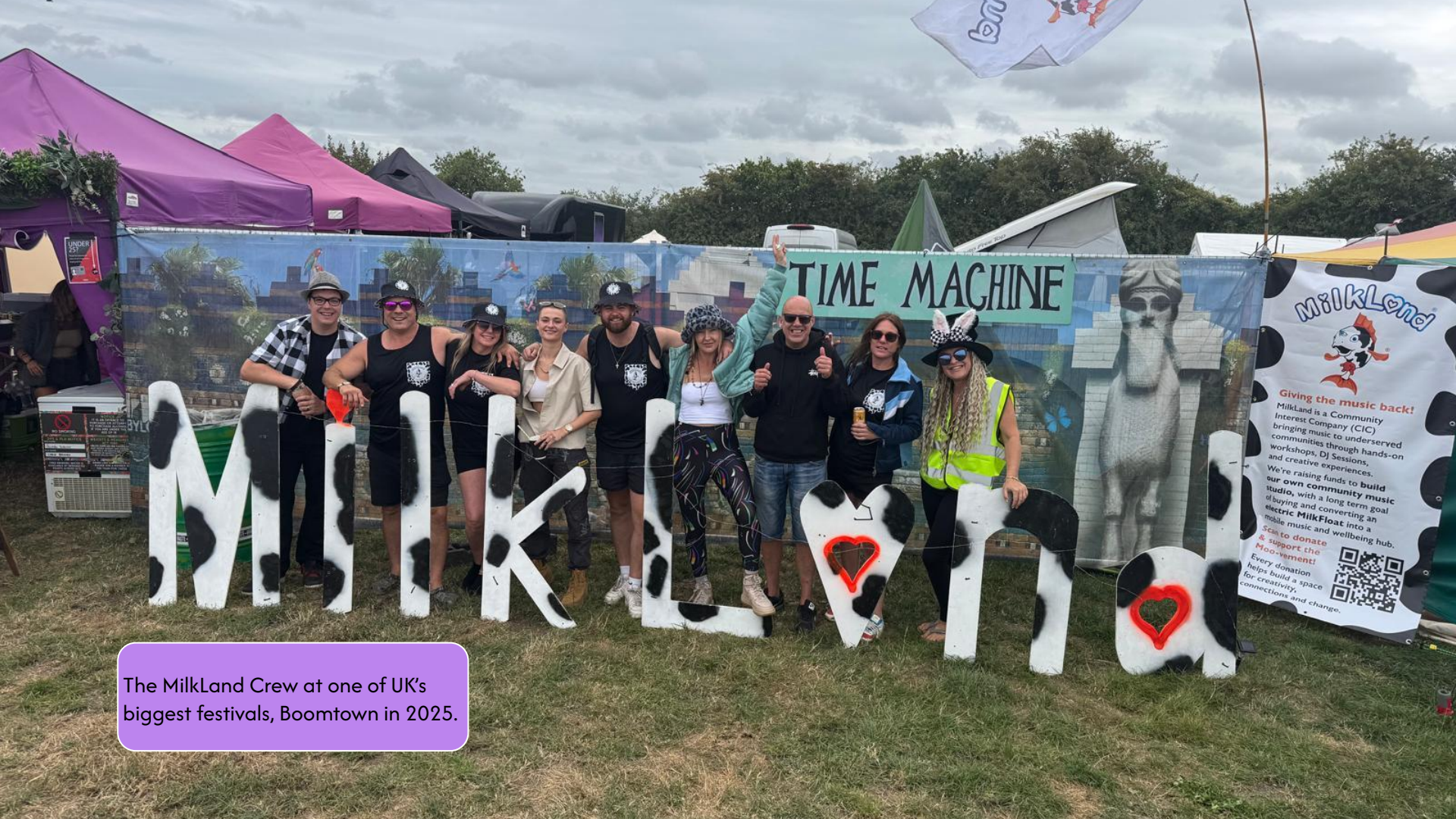
The MilkLand Crew at one of UK's biggest festivals, Boomtown in 2025.